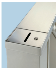
Optional Ticket Box

American Welding Society (AWS) Standard D 1.1