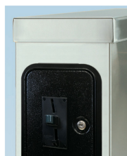
Optional Coin Box