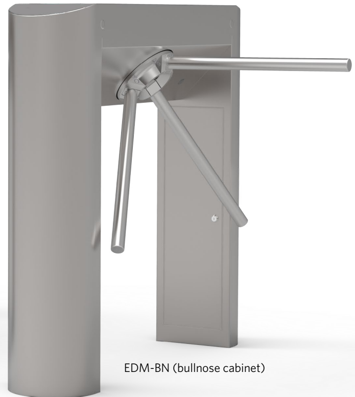
EDM-BN (bullnose cabinet)