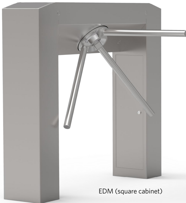
EDM (square cabinet)

The EDM is a waist high turnstile that provides single or bi-directional access control and/or patron counting. Motorized arm rotation provides a very comfortable passage experience for patrons. Upon loss of power or fire system input, the horizontal arm automatically drops to provide a clear exit passageway.